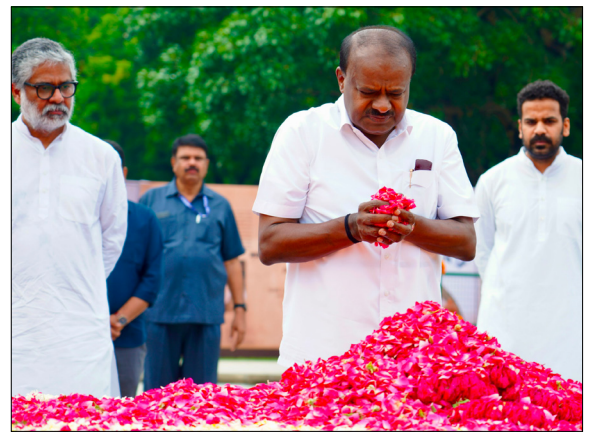
Paid heartfelt tributes at Jan Nayak Sthal, New Delhi, on the 19th death anniversary of former Prime Minister Shri Chandrashekhar. Remembered the visionary statesman for his commitment to public service, democratic values, simplicity and unwavering dedication towards the welfare of the nation.

The renewed conflict has further heightened concerns over the security of one of the world's busiest energy shipping routes. The incident has raised concerns among global shipping operators over possible disruptions to oil supplies and maritime trade in the Gulf region.