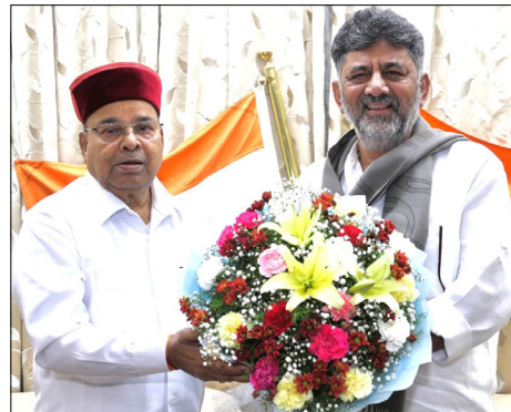
Karnataka Chief Minister D.K. Shiva Kumar meets Governor Thaawarchand Gehlot at Lok Bhavan on Wednesday night during a courtesy visit.