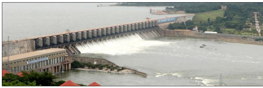
Almatti Reservoir records a sharp rise in inflow to 1.26 lakh cusecs following heavy monsoon rains in the Krishna catchment. With the water level steadily increasing, only a minimal discharge is being maintained as authorities continue to build reservoir storage.

Yadgir received no inflow on Wednesday, though water continued to be released to meet downstream requirements.