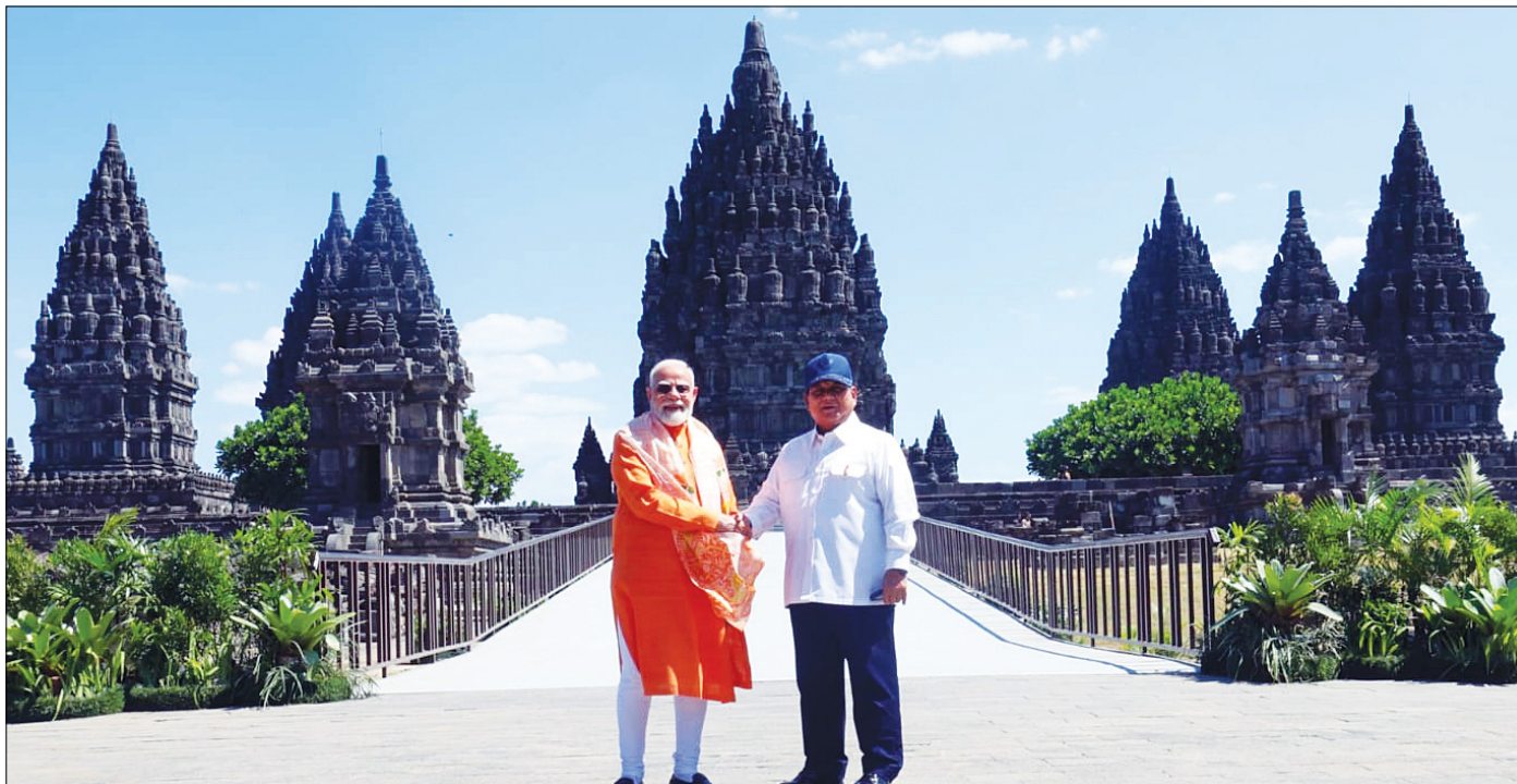
Prime Minister Narendra Modi and Indonesian President Prabowo Subianto inaugurate the UNESCO World Heritage Prambanan Temple Compound Restoration and Conservation Project in Indonesia. The initiative reflects the deep-rooted civilisational and cultural bonds between India and Indonesia, with both nations reaffirming their commitment to preserving shared heritage, traditions and historical connections for future generations.

The Karnataka Lokayukta has concluded raids at 54 locations linked to 10 government officials across seven districts in disproportionate assets cases, uncovering properties, gold, cash and other valuables worth crores of rupees. The raids covered officials from departments including Public Works, Agriculture, Forest, Irrigation and Rural Development. Among those under scrutiny, officials in Bengaluru, Raichur, Kalaburagi, Chitradurga, Shivamogga and Tumakuru were found to possess significant movable and immovable assets, including houses, land, vehicles, jewellery, bank deposits and commercial properties.