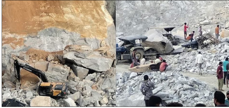
During the process, a large rock allegedly dislodged from a height of around 40 feet and came crashing down into the quarry pit, trapping workers underneath.

Rock Falls During Ongoing Excavation Police said the incident took place at the Kaveri Crusher quarry where excavation work was being carried out at the base of the pit, while rock removal operations were simultaneously underway from the top using heavy machinery.