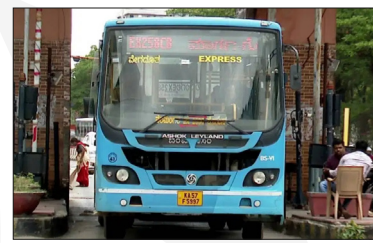
Magadi Road and Hosur Road-Bannerghatta Road stretches. The revised toll rates, effective

The development comes after Nandi Infrastructure Corridor Enterprise (NICE) announced a 10% hike in toll charges across its seven corridors, including Mysuru Road-