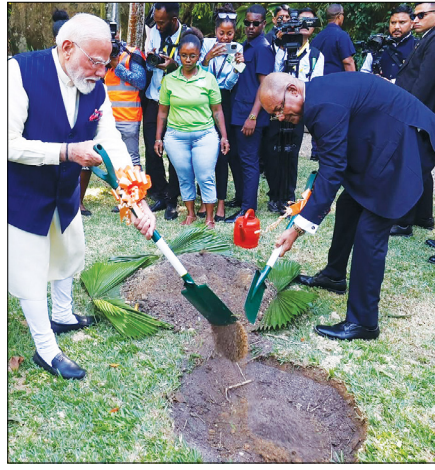
enhance cooperation for the benefit of our people," Modi said.

"Seychelles is a valued maritime partner and a close friend in the Indian Ocean. I look forward to a productive visit that will