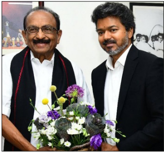
dissatisfied with the importance given to smaller alliance partners.

According to reports, Vaiko was unhappy that MDMK was not allowed to contest elections on its own party symbol and was also