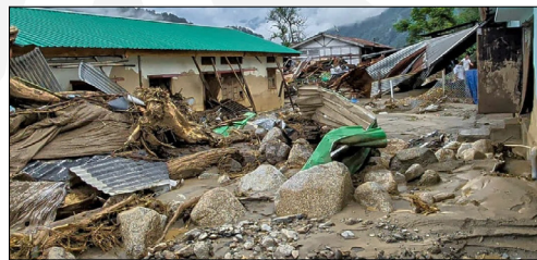
from the Border Roads Organisation (BRO), district administration and local residents are working together to clear debris and restore connectivity.

The Potin-Poosa Village road and the Potin-Yachuli-Ziro road remain blocked due to heavy landslides triggered by the cloudburst. Personnel