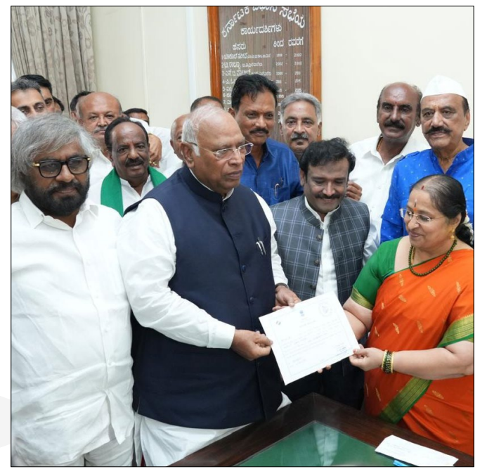
AICC President Mallikarjun Kharge receives his certificate after being elected unopposed to the Rajya Sabha from the Legislative Assembly, in the presence of Rural Development and Panchayat Raj Minister Eshwar Khadre, on Friday.

The investigation is underway to trace the intended recipients and the larger network involved in the alleged smuggling operation.