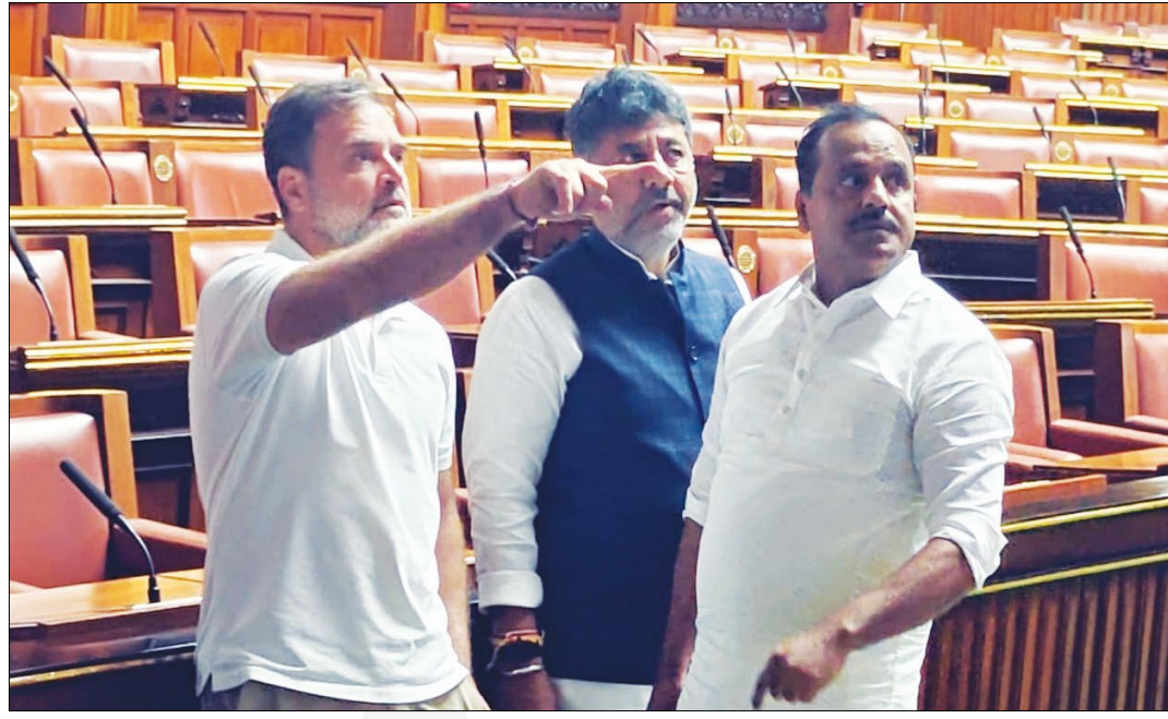
Chief Minister D. K. Shivakumar showed the Karnataka Legislative Assembly Hall to Leader of the Opposition in the Lok Sabha Rahul Gandhi during his visit to Bengaluru on Friday. Health minister U.T. Khader was also present.

The episode has emerged as an early challenge for the Shivakumar-led government, with political observers warning that internal dissatisfaction could embolden opposition parties and test the ruling party's internal cohesion in its early days in office.