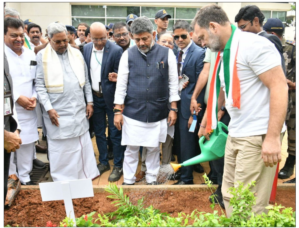
Leader of the Opposition in the Lok Sabha Rahul Gandhi planted and watered a sapling at the Kempegowda International Airport premises in Bengaluru on Friday. Chief Minister D. K. Shivakumar and former Chief Minister Siddaramaiah were present on the occasion.