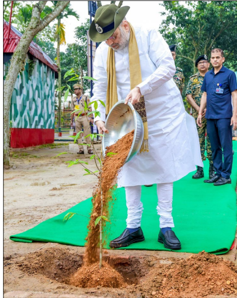
Union Home Minister and Minister of Cooperation, Amit Shah chairs a meeting at BSF Frontier Headquarters, Salbagan, Agartala in Tripura on issues related to border areas.

A similar exemption has been granted to the Bank for International Settlements (BIS) on income generated from investments in government securities.