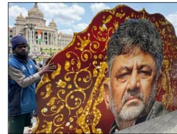
Half-day holiday declared for government offices around Vidhana Soudha on June 3 as Bengaluru gears up for D.K. Shivakumar's swearing-in amid tight security and traffic arrangements.

The government stated that the decision to declare a half-day holiday has been taken to facilitate security arrangements, traffic management and the smooth