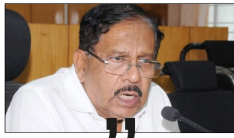
Discontent brews in Karnataka Congress as G. Parameshwara expresses disappointment over missing the CM post, adding pressure on the high command amid intense cabinet negotiations.

Key decisions regarding ministerial berths, deputy chief ministerial positions and portfolio allocation are still under deliberation amid intense lobbying by various factions and caste