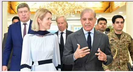
EU-Pakistan talks trigger controversy after a joint statement places Jammu and Kashmir alongside the Russia-Ukraine conflict, raising concerns over diplomatic "hyphenation" and India's long-held stance on the issue.

However, the controversy stems from the official joint press communiqué issued after the talks. In a key section, the document mentioned Jammu and Kashmir and Russia's