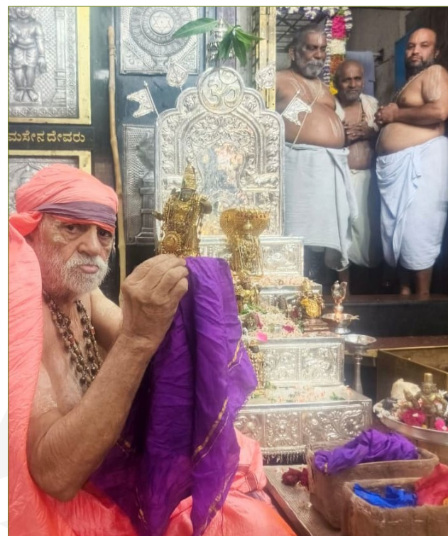
Sri YOGI Madhava Theerthara Adhika Masada Aradhane was celebrated on Tuesday, along with Sri Veera Rama Devvara Samsthana Pooja at Sri Raghavendra Swamigala Matha in N R Colony, Bangalore.

The coming weeks are expected to be crucial, as the decisions taken by Marumalarchi Dravida Munnetra Kazhagam and other alliance partners could redefine coalition equations, potentially leading to a broader political realignment ahead of future elections in the state.