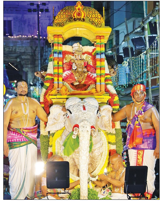
The Brahmotsavams will conclude on Sunday with the sacred Chakrasnamam ceremony at Kapila Theertham, marking the culmination of the annual festivities.