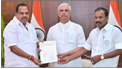
the State Secretariat for political purposes.

Krishnamoorthy alleged that the resignations and subsequent joining of the rebels to the ruling party took place under questionable circumstances, and accused the government of misusing