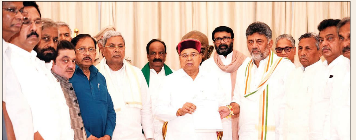
DK Shivakumar, who has been elected as the leader of the Congress Legislature Party, will be sworn in as the new Chief Minister of Karnataka on June 3 at Lok Bhavan in Bengaluru. Governor Thaaawarchand Gehlot will administer the oath of office and secrecy at 4.05 pm. After his election at the CLP meeting in Vidhana Soudha, Shivakumar met the Governor at Raj Bhavan and submitted a letter seeking time for the swearing-in ceremony, which has since been approved along with his prospective Cabinet members.

Swearing-In on June 3 Congress leaders confirmed that Shivakumar will be sworn in as Chief Minister on June 3 at the Glass House of Raj Bhavan in Bengaluru. The