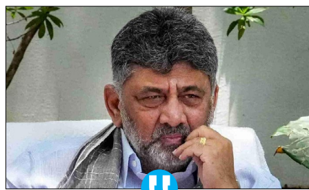
As DK Shivakumar prepares to take over as Karnataka Chief Minister, his political rise is backed by a strong family legacy, deep-rooted connections, and significant influence in both politics and business circles.