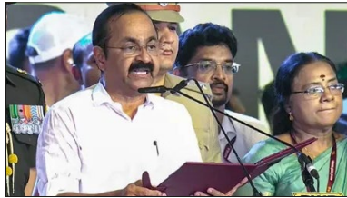
Deputy CM D. K. Shivakumar.

Senior Congress leaders including Rahul Gandhi, Priyanka Gandhi, and Mallikarjun Kharge were present. Chief Ministers Siddaramaiah, Revanth Reddy, and Sukhvinder Singh Sukhu also attended, along with Karnataka