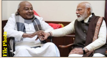
India's 11th Prime Minister from June 1996 to April 1997. A veteran leader from Karnataka, he began his political journey in the 1950s and

later rose to become Chief Minister of the state in 1994. He is widely known for his focus on agriculture, irrigation, and rural development.