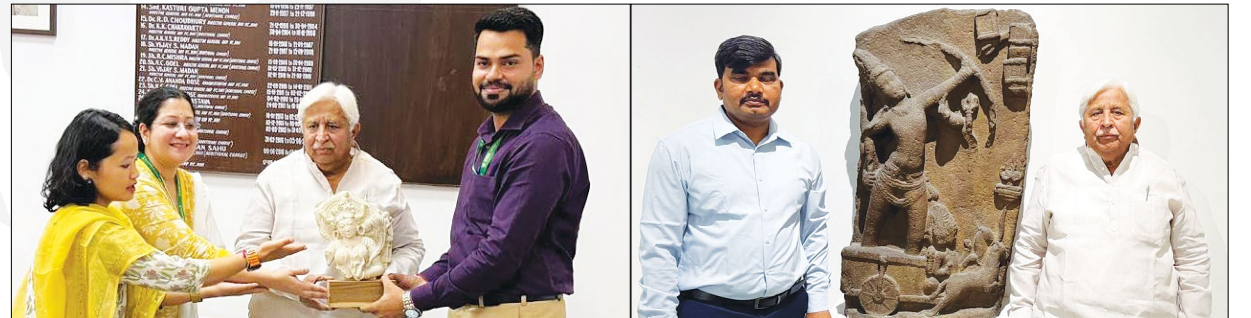
Karnataka Tourism Minister H.K. Patil visits the National Museum in New Delhi and inspects over 150 rare artefacts belonging to the historic Lakkundi region of Gadag district. The priceless collection, originally handed over to former Prime Minister Indira Gandhi on October 16, 1976, by D.K. Hebboor and H.K. Patil includes ancient weapons, rare gold and silver coins, intricately carved ornaments and historic manuscripts. The minister said efforts would be initiated with the National Museum, the Central Government and the Archaeological Survey of India to display the artefacts in a separate gallery in Delhi and eventually bring them back permanently to Karnataka, particularly Lakkundi.

control rooms and ensure adequate staffing and emergency arrangements during heavy rains. Special attention was given to flood-prone railway low-lying areas, where joint inspections will be conducted by Railway officials and City Corporation authorities to address waterlogging and pending infrastructure works. Strict action was ordered against unauthorised road cutting activities without prior permission, while officials were instructed to monitor waterlogging-prone areas periodically and implement preventive measures proactively.