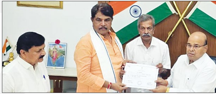
Speaker U. T. Khader has not administered the oath.