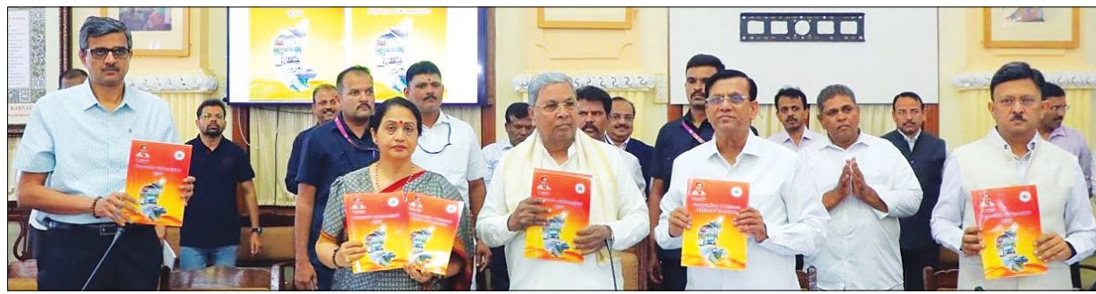
Chief Minister Siddaramaiah chaired a progress review meeting with Additional Chief Secretaries, Principal Secretaries, and Secretaries of the Government at the Conference Hall of Vidhana Soudha. Prior to the meeting, Chief Minister Siddaramaiah released the new Karnataka Progress Portal and its handbook, which provide comprehensive information on all state departments, scheme views, approvals, and coordination of development programmes.

The mendicant reminded him that wisdom lies in understanding the root cause before taking action.