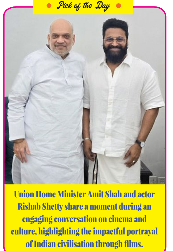
Union Home Minister Amit Shah and actor Rishabh Shetty share a moment during an engaging conversation on cinema and culture, highlighting the impactful portrayal of Indian civilisation through films.

Vikrama Vahini | B'uru Customs officials at Kempegowda International Airport have seized narcotics worth ₹18.62 crore in a major operation, authorities said on Saturday. Acting on specific inputs, officials intercepted three passengers arriving from Bangkok and recovered 52.68 kg of hydroponic drugs concealed in their baggage. The accused have been taken into custody and booked under the Narcotic Drugs and Psychotropic Substances (NDPS) Act. Further investigation is underway to trace the source and intended recipients of the contraband. PG2