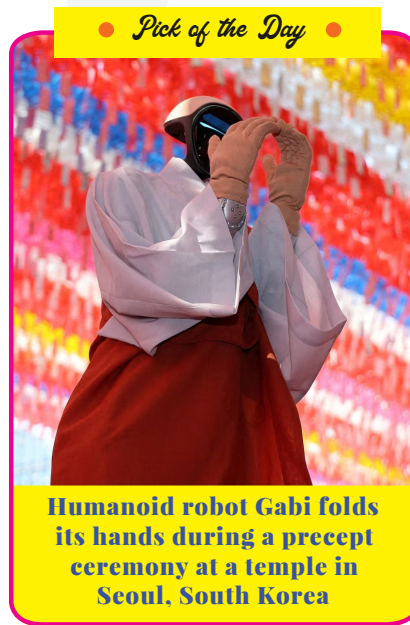
Humanoid robot Gabi folds its hands during a precept ceremony at a temple in Seoul, South Korea