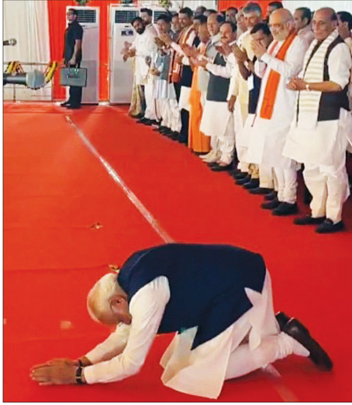
Prime Minister Narendra Modi, who had promised during the West Bengal election campaign to return, fulfilled his commitment by attending the swearing-in ceremony of the newly elected Chief Minister on Saturday. He expressed gratitude for the BJP's victory by bowing before the large gathering at the venue, acknowledging the massive public support.