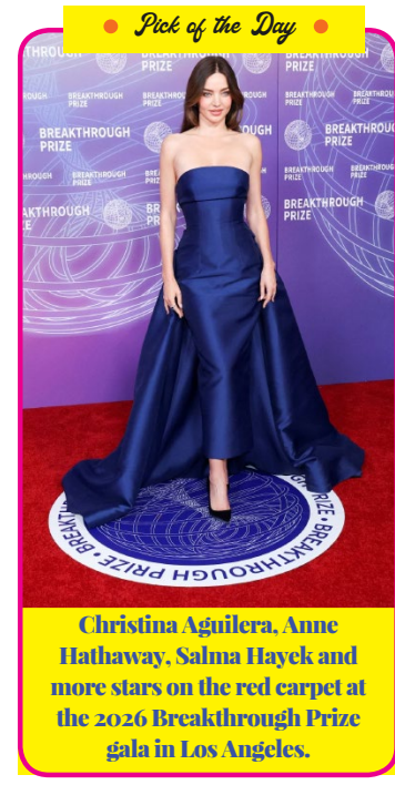
Christina Aguilera, Anne Hathaway, Salma Hayek and more stars on the red carpet at the 2026 Breakthrough Prize gala in Los Angeles.

"This is an extraordinary situation. You may argue abstract legal principles, but we cannot shut our eyes to the practical realities," the judges observed,