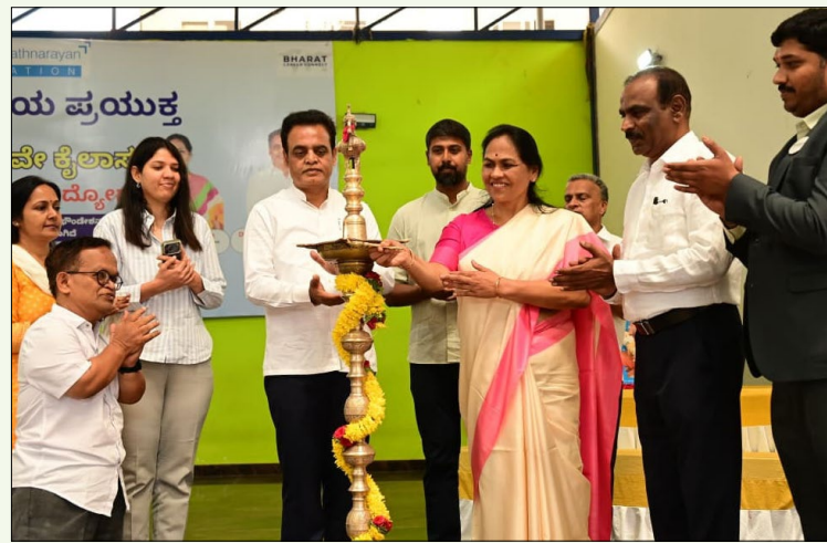
leaders often escape accountability, while public money from the state is allegedly siphoned off and invested abroad," she said, further alleging that the Congress government in the state is corrupt.

"The guilty must be punished. The raid was not carried out without concrete information. Congress