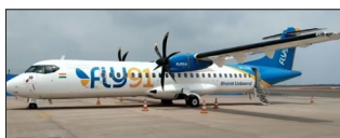
A Fly91 Hyderabad-Hubballi flight was diverted to Bengaluru after a mid-air technical glitch, leaving passengers stranded in the sky for nearly four hours. Though the aircraft landed safely, the prolonged ordeal left flyers shaken and raised concerns over communication and safety.

Passengers onboard described a tense and frightening