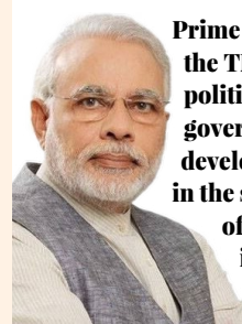
Prime Minister Narendra Modi launched a strong attack on the TMC in Purulia, accusing it of promoting appeasement politics, fear, and "syndicate raj" in West Bengal. He alleged governance failures, corruption, and neglect of tribal development, while urging voters to bring a political change in the state. He said industries cannot grow in an atmosphere of fear and accused the state government of driving away investment. Modi also highlighted the Centre's welfare initiatives for tribal communities.

The Prime Minister also accused the TMC government of creating an environment of fear that discourages investment and industrial growth. "Industries require trust, not fear. No development can take place in such an atmosphere," he said, adding that corruption and the alleged "cut money" culture have driven investors away from the state.