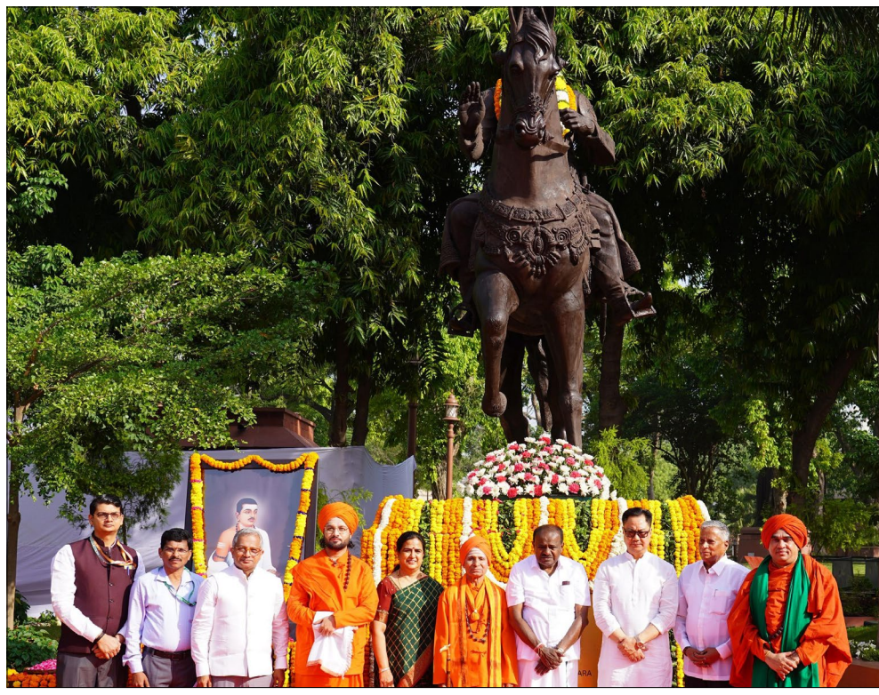
Union Minister H.D. Kumaraswamy paid floral tributes to Jagajyoti Basaveshwara at the Purna Sthal in the Parliament House premises this morning on the occasion of Basava Jayanti. He was joined by Union Minister for Law and Parliamentary Affairs Kiren Rijiju and Minister of State for Railways and Jal Shakti V. Somanna.